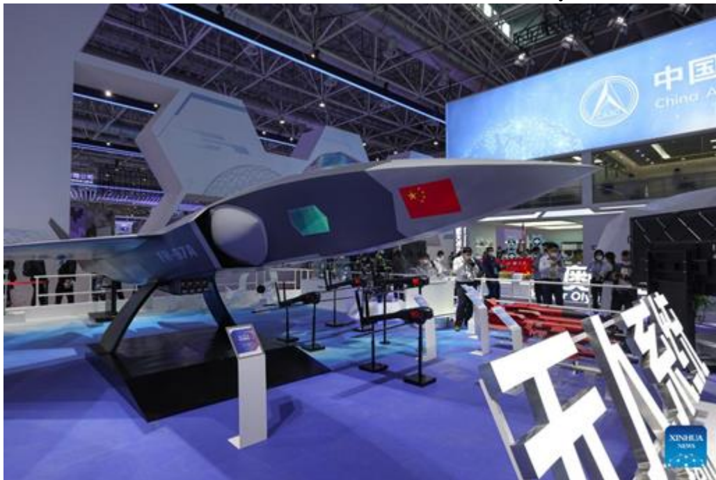
Figure 5: FH-97A displayed at the 14th China International Aviation and Aerospace Exhibition 115

Previously known as the China International Unmanned Aircraft Systems Conference and Exhibition [中国国际无人驾驶航空器系统大会暨展览], the conference was upgraded and renamed the Global Unmanned Aerial Systems (UAS) Conference [全球无人系统大会] in 2019. 112 Since that time, the conference has convened annually in Zhuhai, Guangdong, a center of China's aviation industry and home of the renowned biennial China International Aviation & Aerospace Exhibition [中国国际航空航天博览会], commonly known as the Zhuhai Airshow. The exhibition includes all the major military, government, and corporate actors in China's defense aviation industrial base. In recent years, new UAV prototypes such as the FH-97 "loyal wingman" stealth UAV and AVIC's Wing Loong 3 system had a starring role at the 2022 Zhuhai Airshow. 113 The 2024 Global UAS Conference, which was held on November 10-12, immediately preceded the 2024 Zhuhai airshow, as has been the case in recent even-numbered years. 114