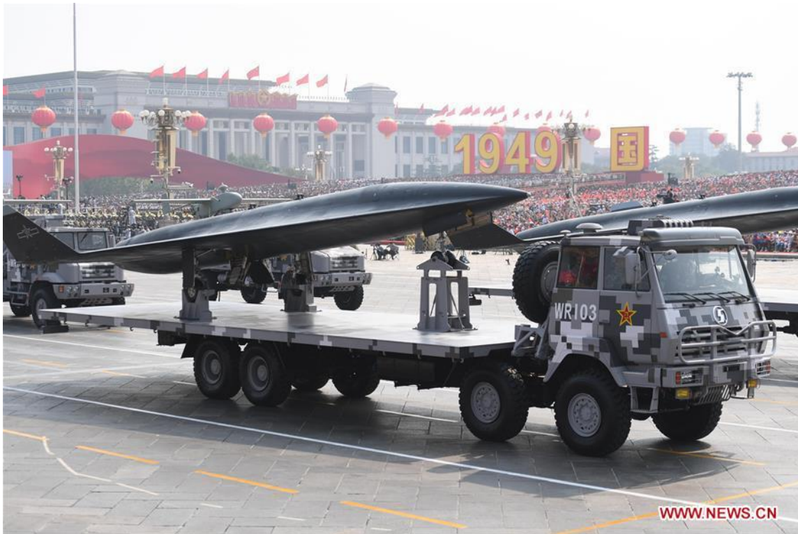
Figure 2: UAVs were prominently displayed at the October 1, 2019, military parade on the 70 th anniversary of the PRC's founding 12

While the PLA once used foreign-sourced drones, production of military UAVs now relies on indigenous production and development. The PRC's defense and aerospace industrial bases facilitate production of UAVs and other dual-use technologies through MCF that has become, per Tai-Ming Cheung and Eric Hagt, a central element of Xi Jinping's "strategy to establish a technologically advanced and militarily powerful Chinese state." 13