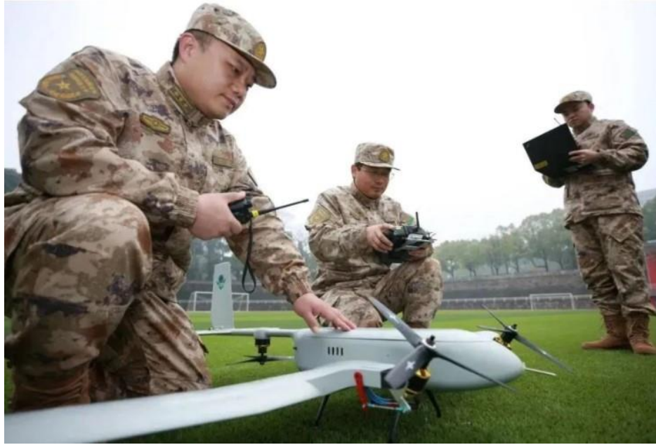
Figure 20: Members of the NUDT Unmanned Combat Systems Innovation Team participate in a field exercise 1821