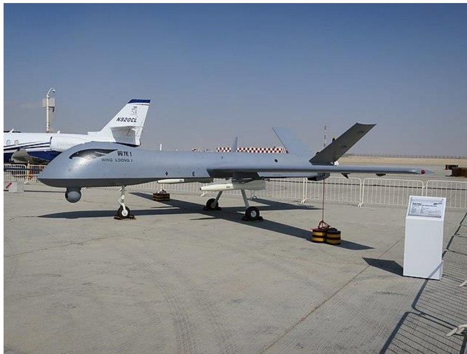
Figure 7: Wing Loong I [翼龙-I] UAV 159