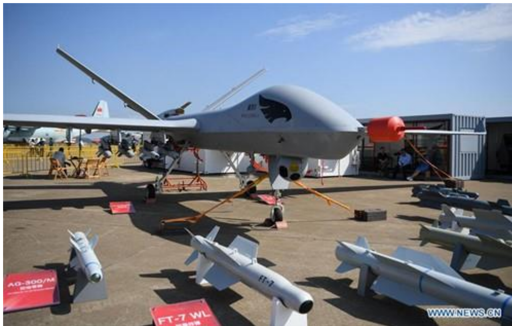
Figure 8: A Wing Loong II UCAV at the 12th China International Aviation and Aerospace Exhibition 168