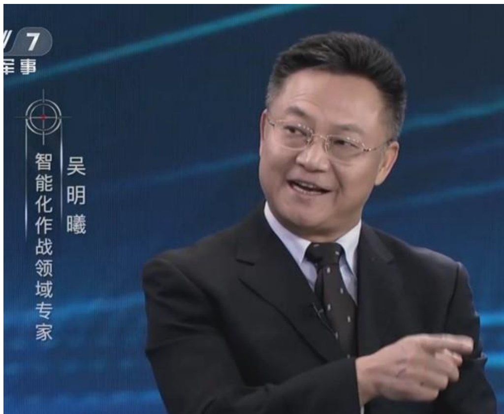
Figure 4: Wu Mingxi, AI expert and Chief Scientist with NORINCO, CMC-affiliated expert