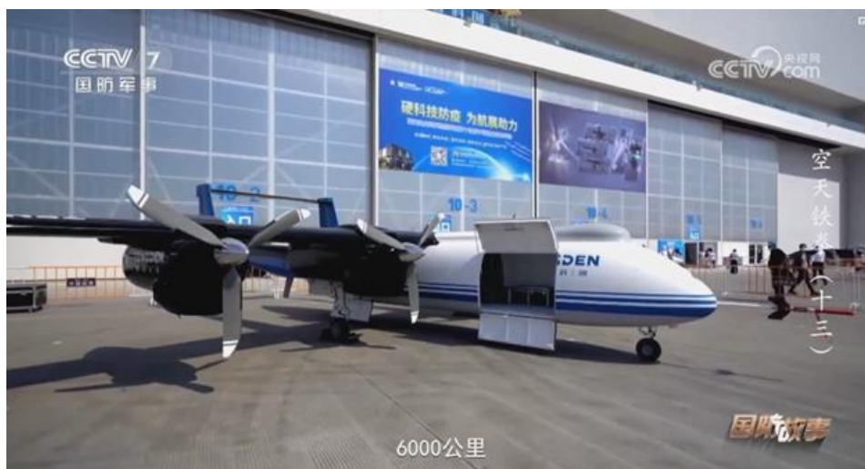
Figure 15: Twin-tailed Scorpion-D quad-engine drone transport (CCTV-7) 1110