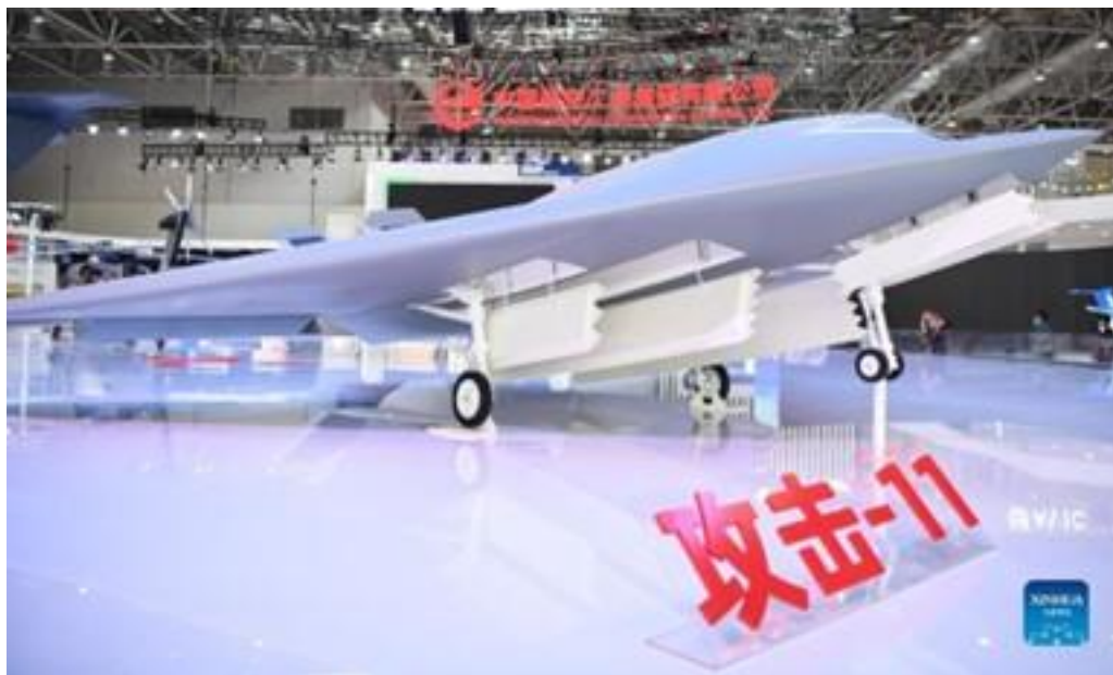
Figure 10: GJ-11 “Sharp Sword” [攻击-11 利剑] at the 13th China International Aviation and Aerospace Exhibition 336

SADI also serves as an academic institution, training master's and Ph.D. students in relevant fields. 333 SADI's professional training covers 55 fields, including aircraft aerodynamics, flight control, electromechanical systems, avionics, aircraft support, UAVs, aviation product research and development, flight control, fuel systems, integrated electronic fire control, and full aircraft R&D. 334 The institute is also responsible for the digital engineering of the national defense aircraft manufacturing industry. 335