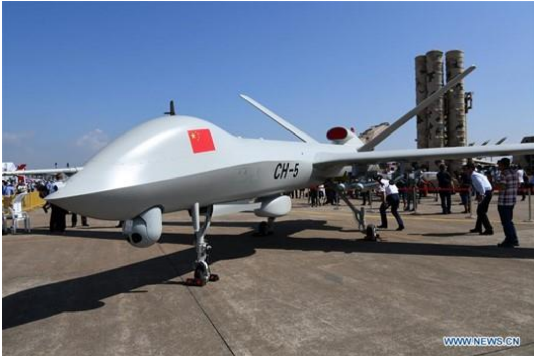
Figure 13: CH-5 UAV on display at the 12th China International Aviation and Aerospace Exhibition 599