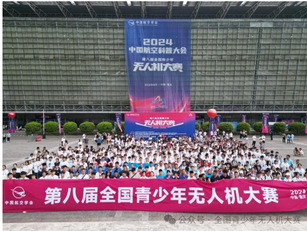
Figure 6: Group Picture at the CSAA's 2024 "National Youth Drone Competition" 118