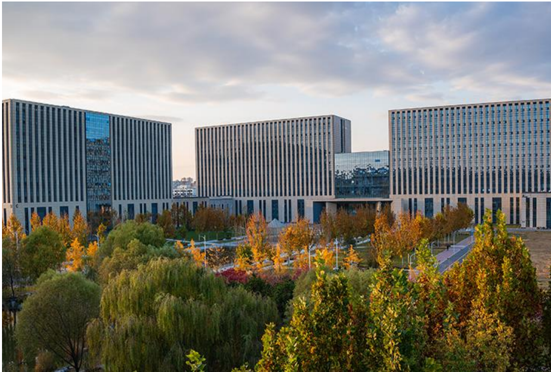
Figure 19: Campus of Beihang University in Haidian District, Beijing 1480