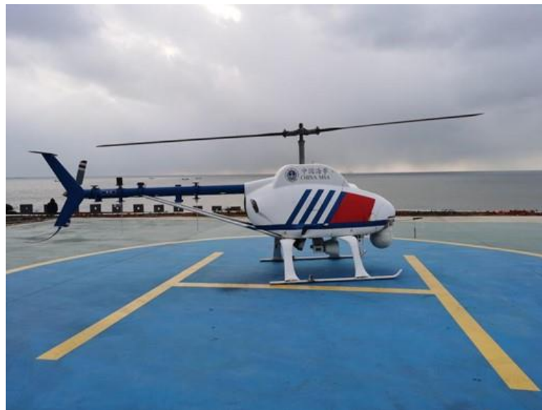
Figure 11: AR-500 unmanned helicopter 443

The institute is divided into two parts, the Jingdezhen Helicopter Base [景德镇直升机基地] in Jingdezhen, Jiangxi Province (known for its famous porcelain), and the Tianjin Helicopter R&D Center in the Tianjin Binhai New Area. 440 CHREDI currently has over 3,000 employees. 441 CHREDI has developed 12 helicopter models, including the Z-8, Z-9, Z-10, Z-11, Z-19, AC series, and UAVs, based on a framework of “military-civil fusion, one machine with multiple models, and series development.” 442