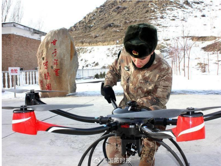
Figure 1: A PLA border patrol soldier repairs prepares to pilot a small UAV 7

Although UAVs are not a new technology, emerging technologies, including artificial intelligence and machine learning, advanced robotics, advanced image sensing, improved battery and energy storage, and improvements in materials science and aeronautical design are combining to make UAVs more effective and efficient in performing their missions. In a July 2024 People's Liberation Army Daily article, two experts from the PLA Academy of Military Sciences (AMS) Institute of War Studies observe that, due to “the improvement of autonomous combat capabilities, the ratio of humans to unmanned equipment has gradually changed from ‘many controlling one’ (that is, multiple people operating one unmanned equipment platform) to ‘one controlling one [vehicle]’ and ‘one controlling many [platforms]’.” 8